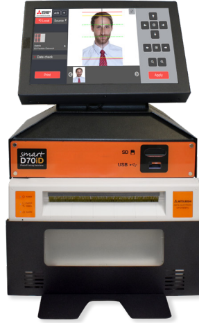
Smart D70iD Photo ID system